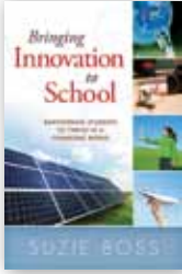
Bringing Innovation to School