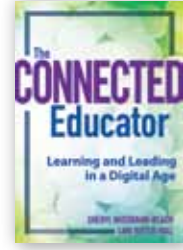
The Connected Educator

* Library editions available on most titles. Call 800.733.6786 for details.