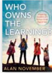
Who Owns the Learning?